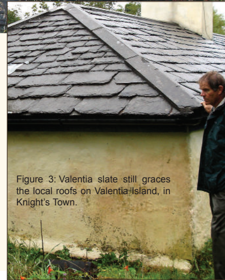
Figure 3: Valentia slate still graces the local roofs on Valentia Island, in Knight's Town.

There are many buildings in southern Ireland and elsewhere throughout Ireland and parts of Europe that remain roofed with original Irish slate. Although some of these old roofs need repair and restoration, the durable slate itself is showing no signs of giving up or even slowing down. At least one roof slate salvage operation is in business in southern Ireland in the form of Killoran Slate Quarry, Ltd, in Nenagh, County Tipperary ( irishslate.com ), which is also a broker for new roofing slate, but not a quarrier. Killoran salvages original Irish slates, re-trims them, then sells them for restoration purposes.