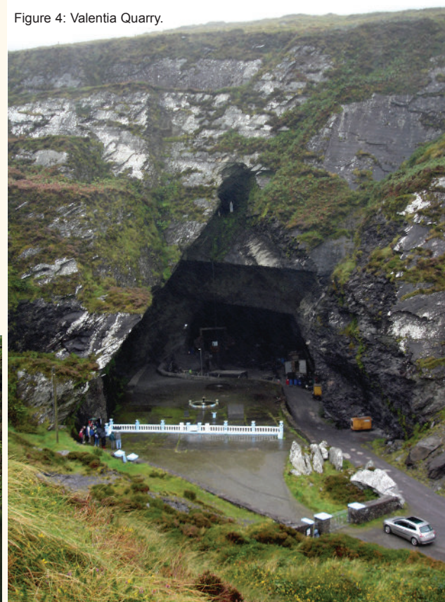
Figure 4: Valentia Quarry.

Although this is obviously not meant to be a comprehensive report on Irish slate, it nevertheless shines a light on a long neglected topic. If you go looking for the quarries, pack an umbrella, but don't worry about getting thirsty — a cozy pub will only be a stone's throw away. ☒