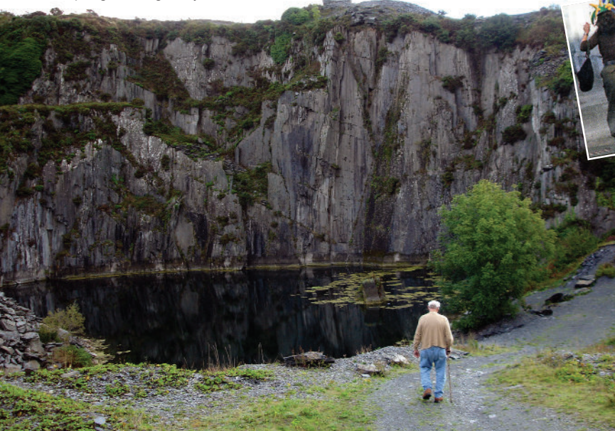
Figure 1: Haunting and lonely, an Ormonde slate quarry pit now remains only as a deep lagoon ringed by slate cliffs.

some were still inhabited. The mild climate in this part of the world rarely causes frost. Even palm trees were growing in the southern extremes of Ireland. Large Celtic crosses dating back to the 700s remain upright in rural graveyards. Our bus traveled many a narrow, winding road lined with tall hedges. Stone walls criss-crossed the open countryside.