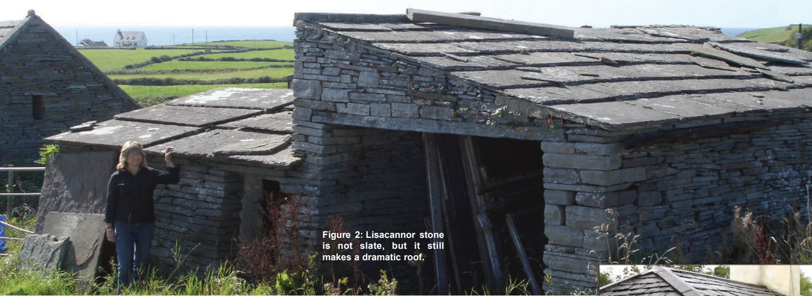
Figure 2: Lisacannor stone is not slate, but it still makes a dramatic roof.