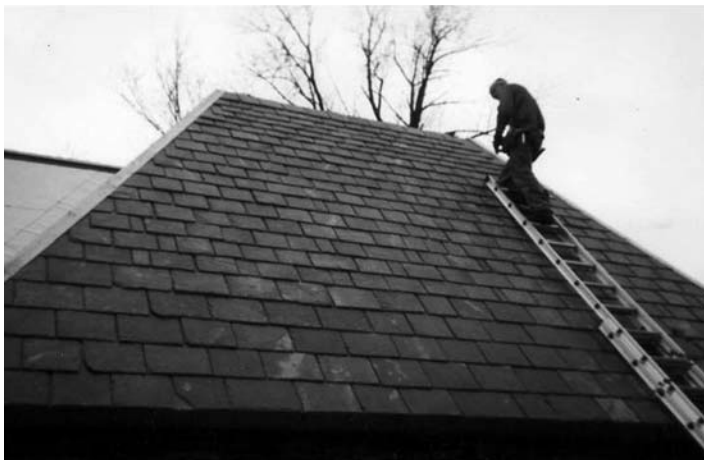
Putting the finishing touches on one side of garage, Erie, PA. Most of the faces had hips on both sides so we started in the middles and worked our way to the edges. Note how the steep roof pitch allowed us to lay ground ladders right on the roof, thereby avoiding the need for any roof planks.